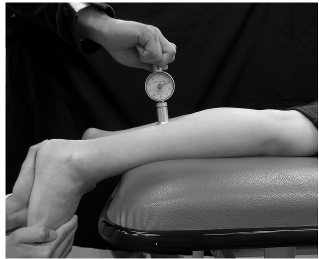
Fig. 1 Measurement of muscle hardness

Soleus muscle hardness was measured using a muscle hardness meter (NEUTONE TDM-N1, TRY-ALL